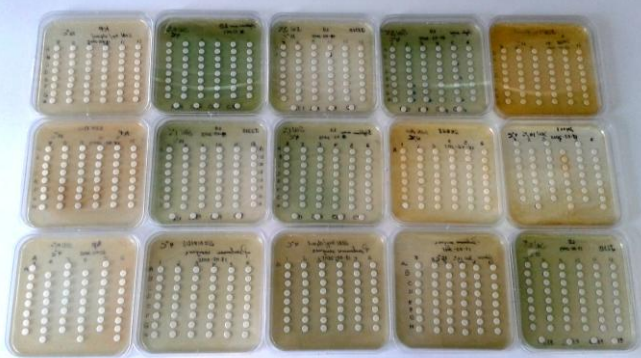
against all set of strains. The following protocol followed.