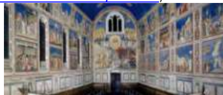
Padua 40 min