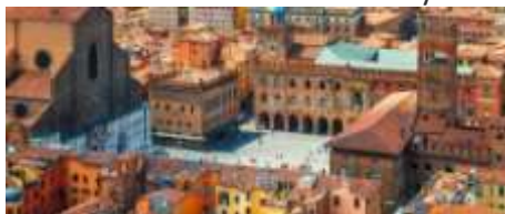
Bologna 35 min

All these destinations are easily reachable by train from Ferrara ( https://www.trenitalia.com/en.html )